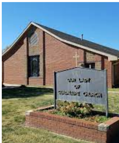
Our Lady of Guadalupe

(316)282-0459 106 E. 8th St. Newton, KS 67114